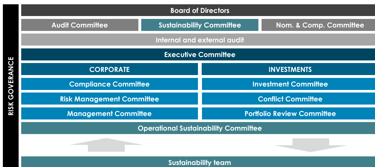
■ Committees and teams directly involved in the oversight and management of climate risks and opportunities

The Group Board Sustainability Committee and Operational Sustainability Committee hold responsibility for ensuring climate risks and opportunities are properly considered throughout the investment process across the Group. Both committees sit within the broader committee structure for risk governance at Antin, as outlined below. AIP UK reports to the Group Board in line with the Group process below.